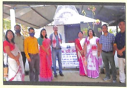
Women's cell DHSK college and Dibrugarh Mandal women's cell's (ACTA) Visit to Pujashree Oldage Home on 8th March, 2021 on 'Internati