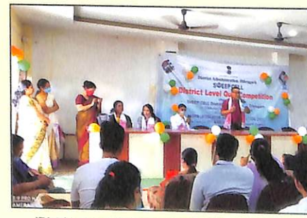
'District Level Quiz Competition" held in DHSK college, organised by SVEEP cell District administration,in collaboration with DHSK college on 15th March, 2021