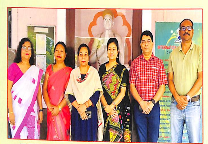
DEPTT. OF ANTHROPOLOGY