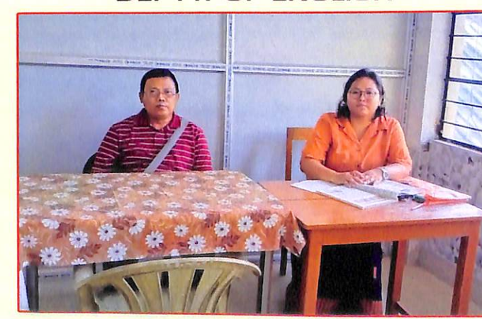
DEPTT. OF HINDI