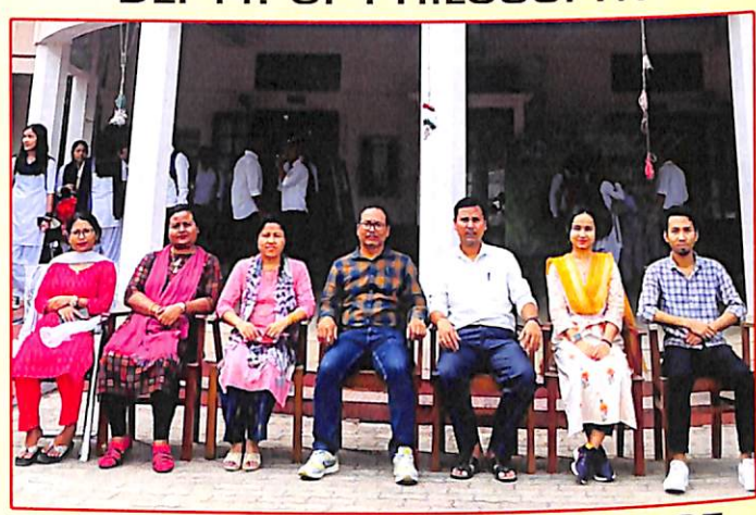
DEPTT. OF POLITICAL SCIENCE