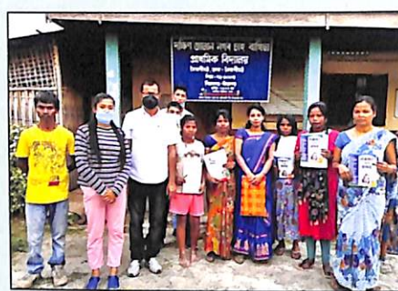
Extension Activity of DHSK College, Dibrugarh. Literatracy drive for women at South Jalan Nagar Tea Garden Lower Primary School on 18th April, 2021