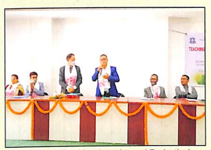
F. D. P. on 'Teaching, Learning and Evaluation organized by ICGC, DHSK College in collaboration with Assam Science & Technology University (ASTU) Guwahati from 5th January to 11th January 2021