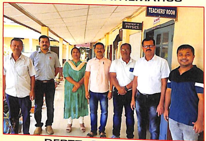
DEPTT. OF PHYSICS