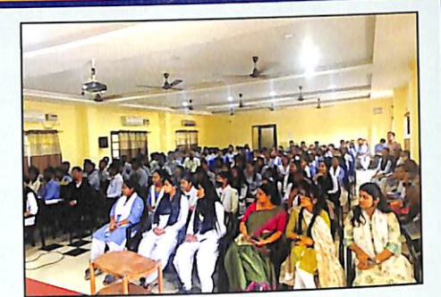
Seminar on "Personality Development and Career Growth" organised by Royal Global University, Guwahati in collaboration with I.C.G.C.DHSK College, Dibrugarh on 13rd March, 2021