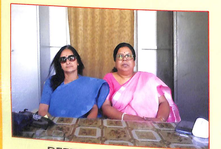
DEPTT. OF BENGALI