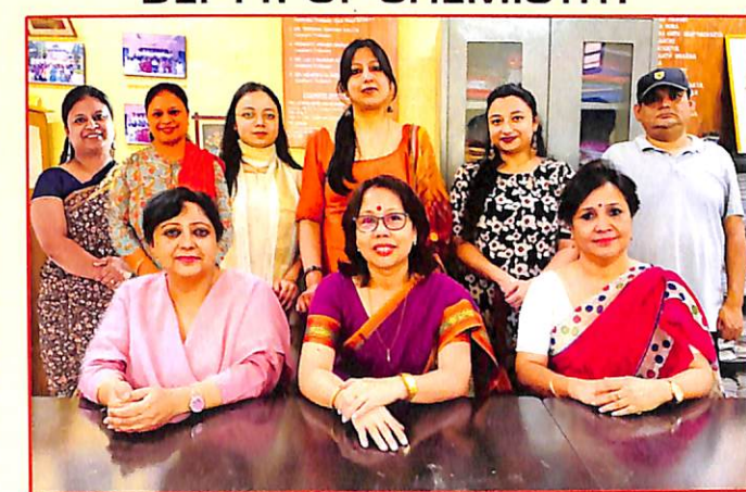
DEPTT. OF ENGLISH