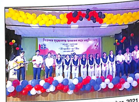
Freshers Social Celebrated on 8th November, 2021