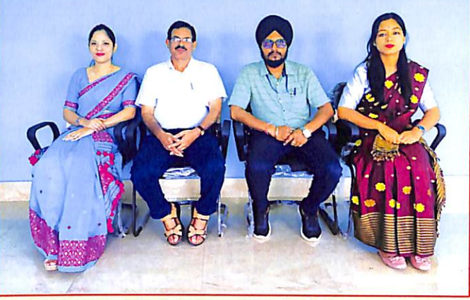
DEPTT. OF BCA