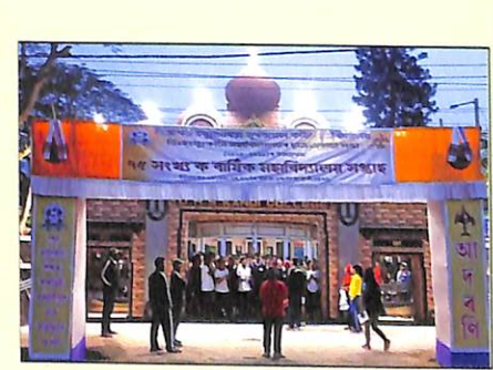
"College week"DHSK college, held in 18th to 23rd February, 2021