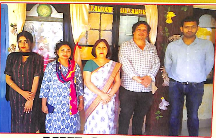
DEPTT. OF BOTANY