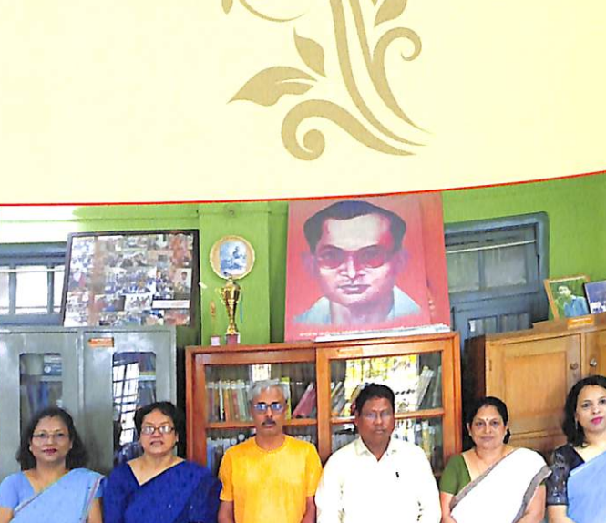
DEPTT. OF ASSAMESE