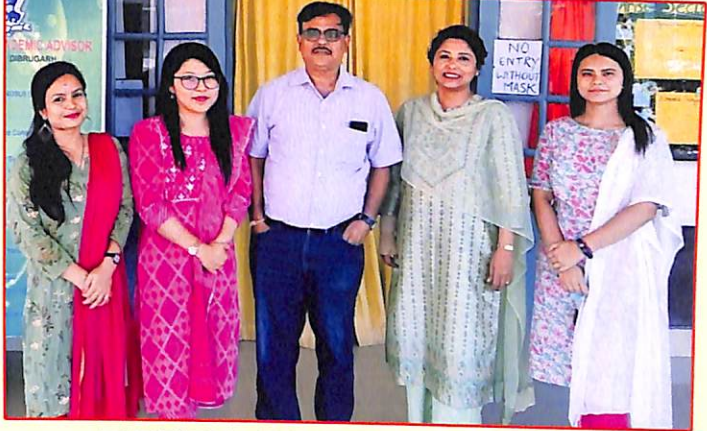
DEPTT. OF ECONOMICS