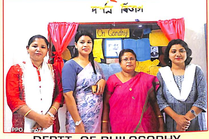
DEPTT. OF PHILOSOPHY