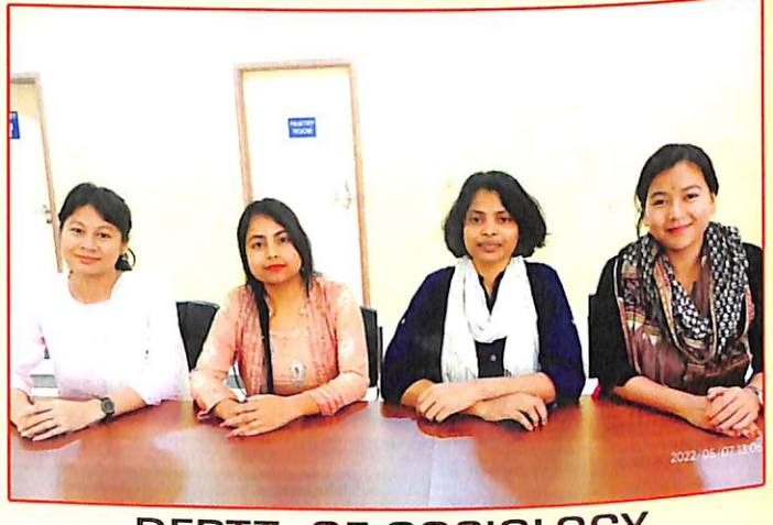
DEPTT. OF SOCIOLOGY