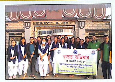
"Swatchata Ahhiyan"organized by Student Union of DHSK College, 23rd February, 2021