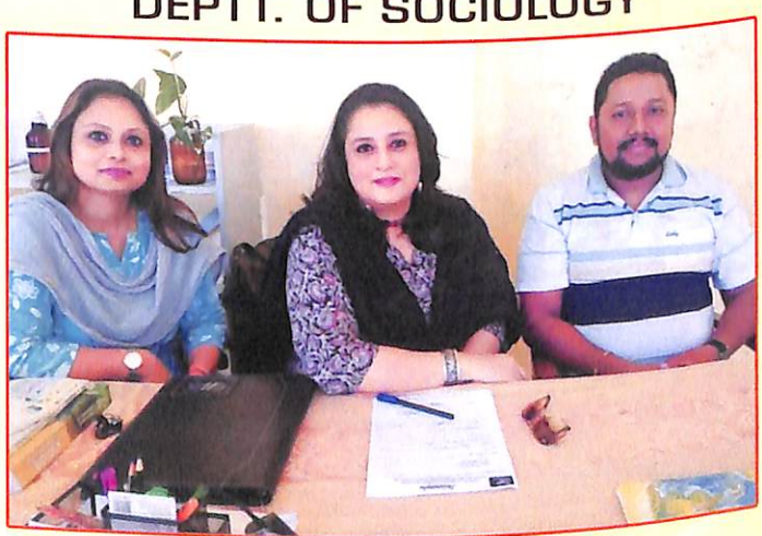
DEPTT. OF ZOOLOGY