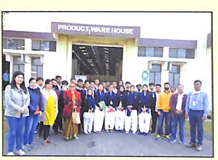
Visit to BCPL on 22 January, 2021