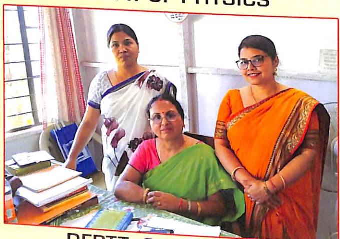
DEPTT. OF SANSKRIT