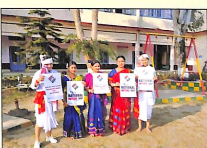
National Voter's Day Celebrated by NSS in Collaboration with District Administration on 25th January 2021