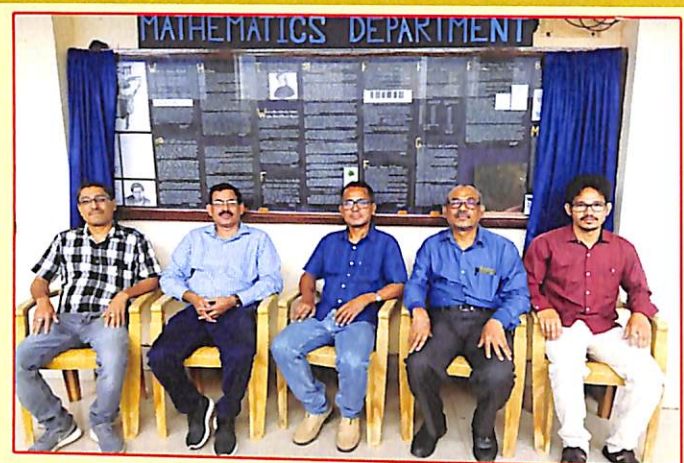
DEPTT. OF MATHEMATICS