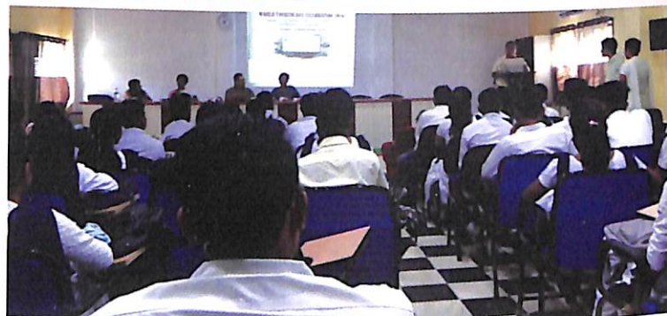
World Tourism Day observed by the History Dept.