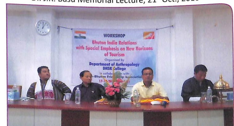
Workshop on Bhutan-India relation 17 th Oct., 2016