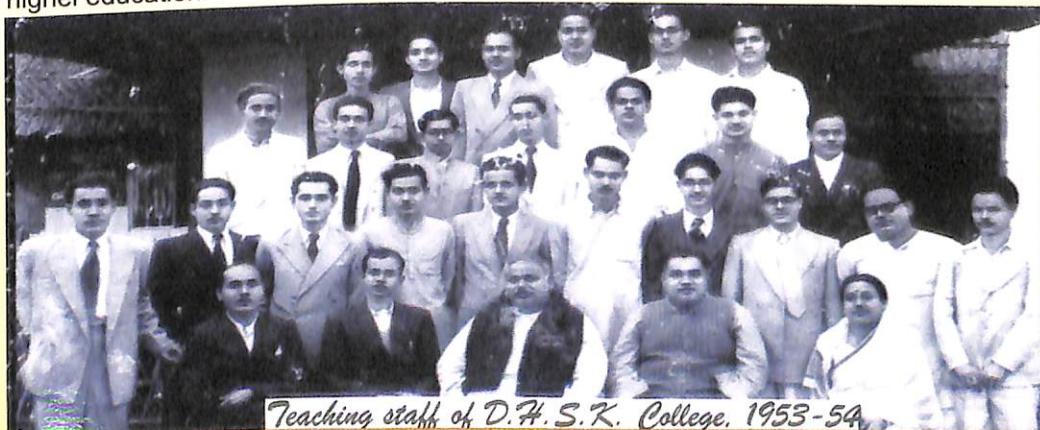
Teaching staff of D.H.S.K. College, 1953-54