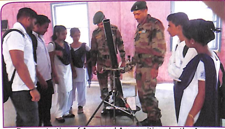
Demonstration of Arms and Ammunitions by the Army, 7 th and 8 th Aug, 2016