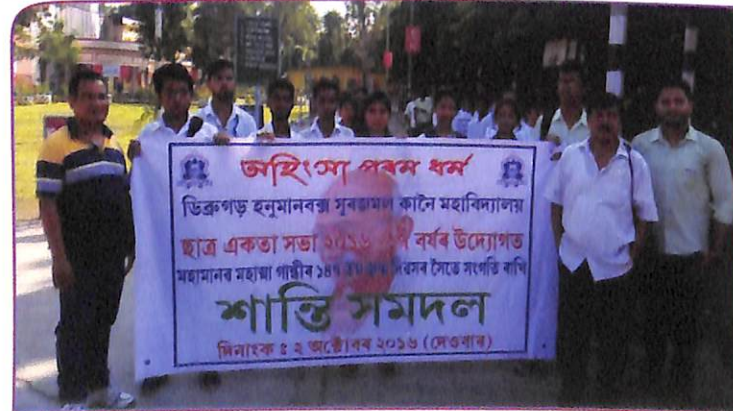
Peace procession on the occasion of Gandhi Jayanti, 2016