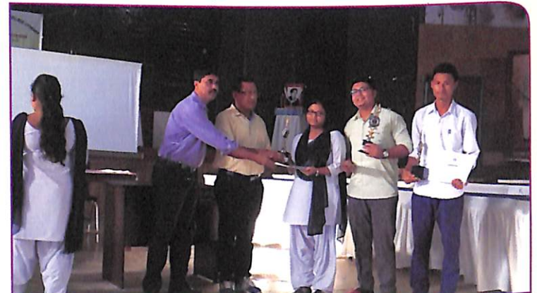
P.N.S. Memorial Inter College Quiz Competition, 27 th Sept, 2016