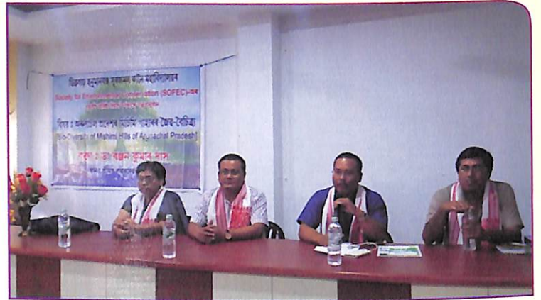
Foundation Day of 'SOFEC' 12 th Aug, 2016