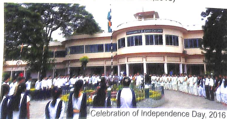
Celebration of Independence Day, 2016