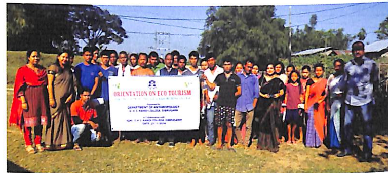
Orientation on Eco-Tourism at Sorai Habi Mishong village(25/11/2016)