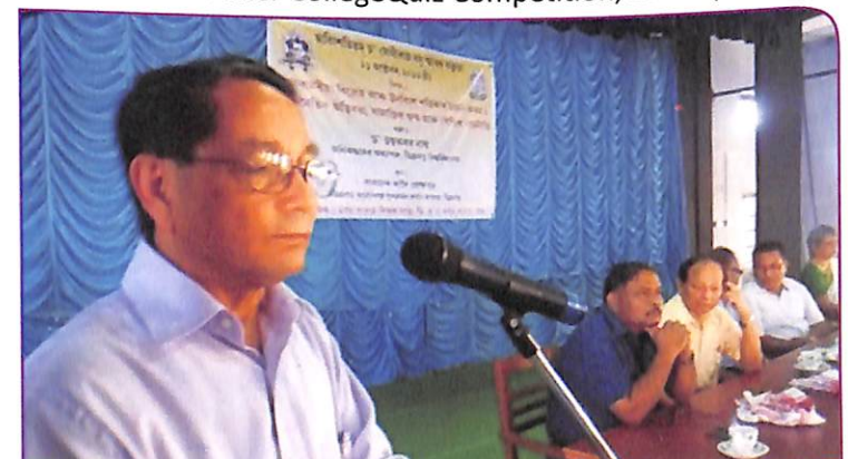
Dr. J.R. Basu Memorial Lecture, 21 st Oct., 2016