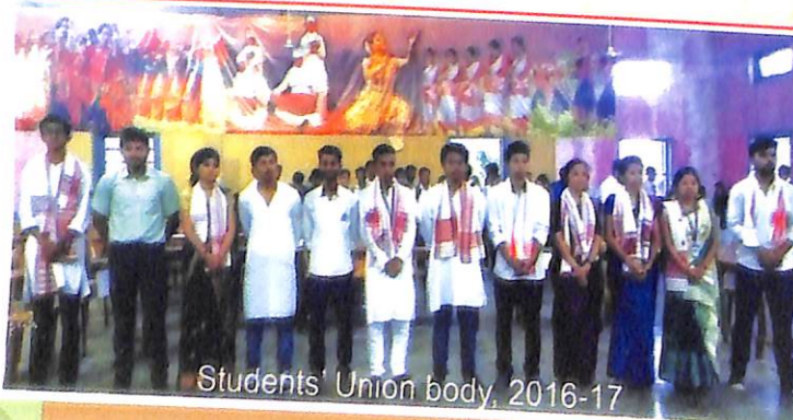
Students' Union body, 2016-17

4. The NSS Volunteers of DHSK College Wing had participated in the University Workshop Digital India at Dibrugarh University held at Rang Ghar, Dibrugarh University and won the 2 nd Prize on the Quiz competition organized by the Dibrugarh University on Digital India.