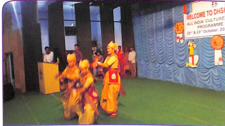
All India Cultural Exchange Programme, 22 nd & 23 rd Oct., 2016