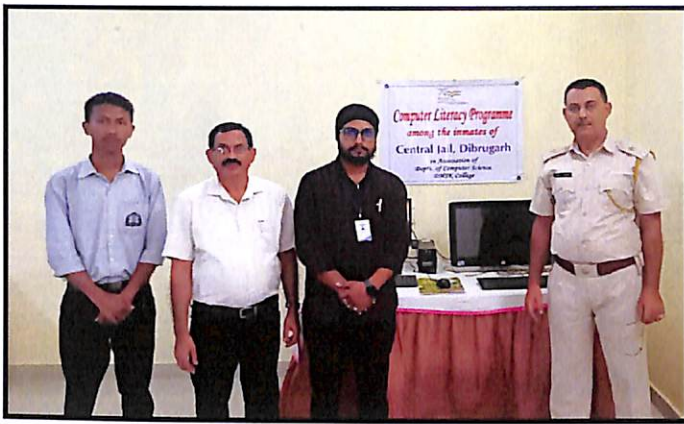
Computer Literacy Programme Among the inmates of Central Jail, Dibrugarh on 27th September, 2022