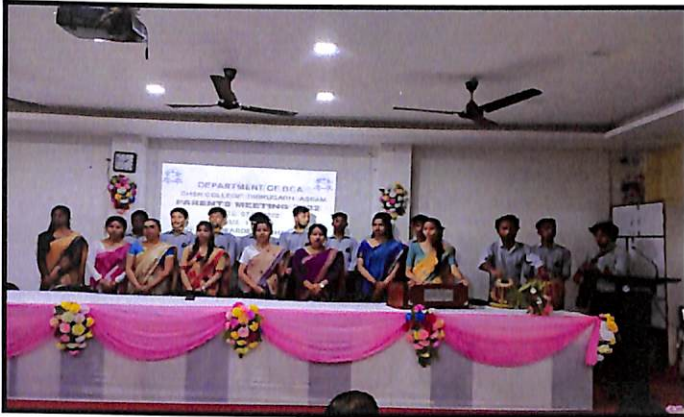
Parents Teachers Meet, May 2022