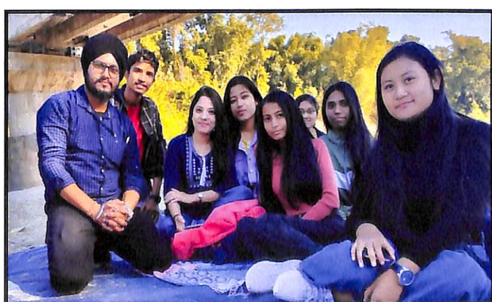
Field Trip to Nari Village, Dec 2021