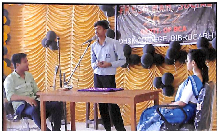
Freshers Celebration, 2022