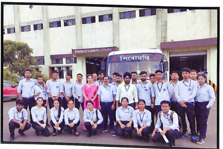
A Visit To BCPL (Brahmaputra Polymer and Cracker Limited)